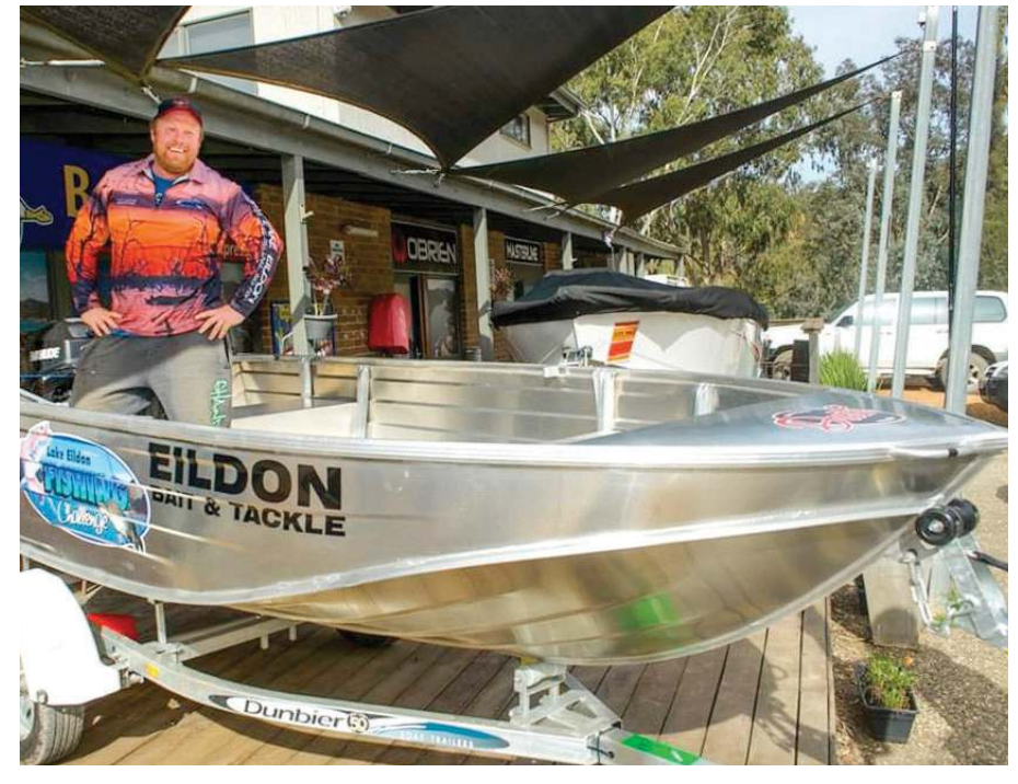
Last year's winner of the 2019 Lake Eildon Fishing Challenge boat package.

Eildon Pondage Caravan Park. He had landed some rainbow and brown trout with two of his best specimens weighing in at a combined 4.5kg. Trout in the pondage are caught all year round and take PowerBait, spinners, worms and flies just to name a few. If you are fishing the pondage at Eildon, drop into Eildon Bait and Tackle. Craig can update you on the latest news when it comes to when and where the best spots for fishing the pondage and rivers around Eildon.